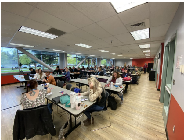
Participants at the 2025 Mat-Su Reentry Summit

In conclusion, I would like to give a big thank you to all the amazing speakers, planning committee members, and volunteers that helped to make this year’s Reentry Summit a success. Also, I would like to thank the Mat-Su Health Foundation for supplying the funding for our annual Mat-Su Reentry Summit. We will have the filmed sessions of the Reentry Summit up on our Reentry Website in October ( https://www.valleycharities.org/mat-su-valley-reentry-program/ ).